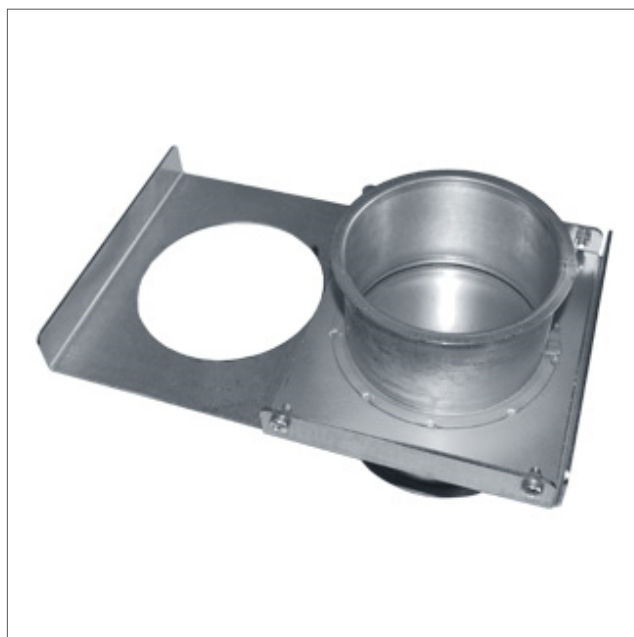
GADA - Sliding damper manual