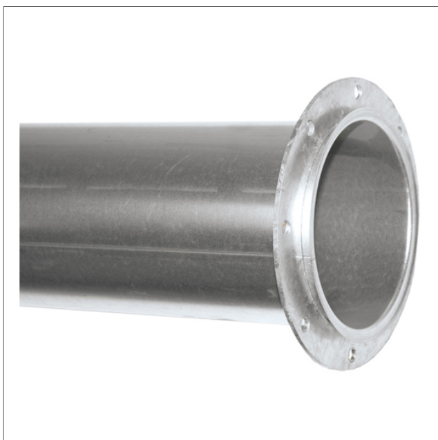
GAPF - Pipe laser welded flange

Laser-welded galvanised steel tube with pull ring edge. Length-wise seam from \text{Ø}450 mm. Used for dust extraction and transport of lighter material such as dust and wood shavings. Wall thickness = 0.7-0.9 mm.