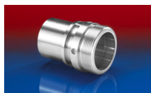
CONNECT THREAD FITTING 234