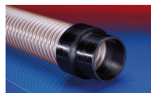
CONNECT 240 + 241 AS