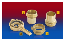
CONNECT TANK TRUCK BRASS 252