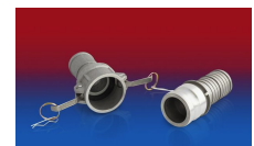
CONNECT KAMLOK ALU 253