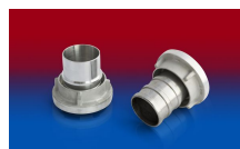
CONNECT STORZ DIN ALU 251