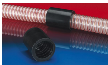
CONNECT 246 AS