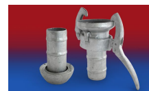
CONNECT KARDAN 254