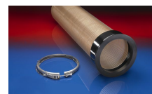
CONNECT 245 VAC-TRUCK

Overpressure and underpressure are recommended threshold operating values, products can be subjected to higher loads upon request. The bending radius is measured through the inside of the hose arch. The right to make technical modifications is reserved. All values determined at 20 °C and are approx. data. Additional information at www.norres.com/en/technology/