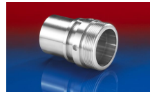
CONNECT THREAD FITTING 234