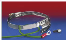
CLAMP 212 EC