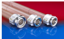
CONNECT SAFETY CLAMP ASSEMBLY 231