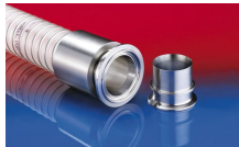
CONNECT PRESS ASSEMBLY 232