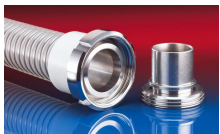
CONNECT MOULD ASSEMBLY 233