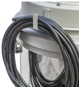
Cable Holder Hook included on the side of the powerhead