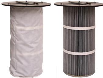
Conductive Aluminized Spun Bond Reverse Purge Cartridge (shown with and without optional skirt) - Included