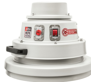
Longer Life Brushless Motor Available (always with 4 x H14 HEPA filters)