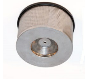
Upstream HEPA Filter - Included