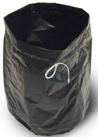
Conductive Polyliner Recovery Bag - Optional