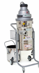
C-35L EX DT (MRP) with Recovery Tank removed