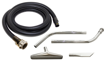
C-35 EX DT Tool Kit - included