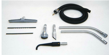
Ø1.5 (Ø38 mm) Static Dissipative Tools and Accessories - Included