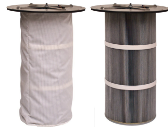
Conductive Aluminized Spun Bond Reverse Purge Cartridge (shown with and without optional skirt) - Included