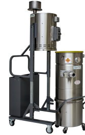
CD/EUR-36L EX DT (MRP) ULPA with Recovery Tank and Filter Chamber removed