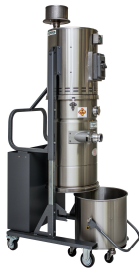
CD/EUR-36L EX DT (MRP) ULPA with Recovery Tank removed