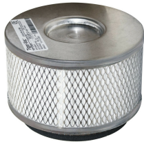
HEPA Filter - Included