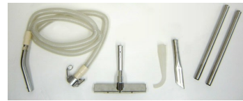
CWR EX Tools and Accessories - Included