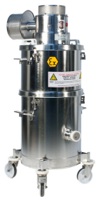
CWR-10 EX (4W) MRAC