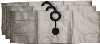
Conductive Recovery Bags - included