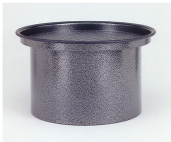
Activated Carbon Cartridge - Optional