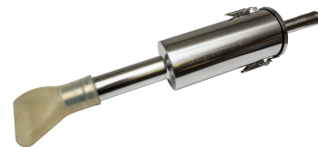
Needle Trap - Optional