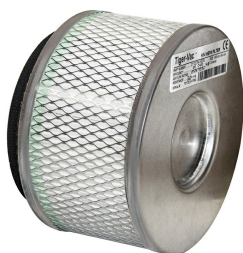
HEPA Filter - Included