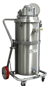
EXP1-25 (TC) RE HEPA