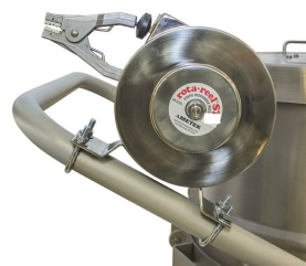
Grounding reel with stainless steel housing and cable - Optional