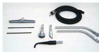
Ø1.5 (Ø38 mm) Static Dissipative Tools and Accessories - Included