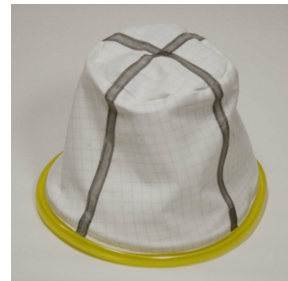
Main Cloth Filter, Static Dissipative - Included