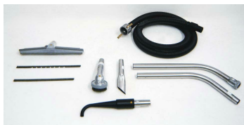
Ø1.5 (Ø38mm) Static Dissipative Tools and Accessories - Included