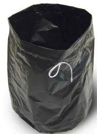
Conductive Polyliner Recovery Bag - Included