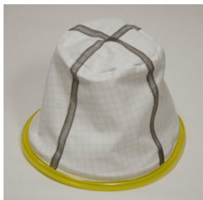
Main Cloth Filter, Static Dissipative - Included