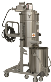
EXP1-55L DT with detachable recovery tank