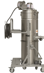
EXP1-55L DT Sideview 2