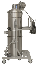
EXP1-55L DT Sideview 1