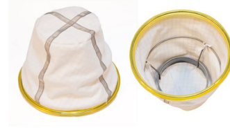
Main Cloth Filter with Cage, Static Dissipative - Included