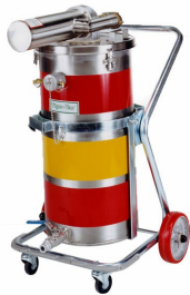
SS-25 (TC) TE