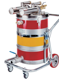
SS-55 (TC) TE TWIN VENTURI