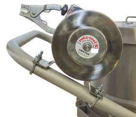
Grounding reel with stainless steel housing and cable - Optional