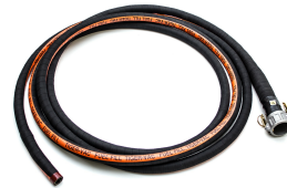
Nitrile Suction Hose - Included