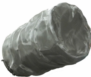
Stainless Steel Mesh Filter - Included