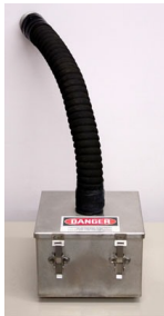
Activated Carbon Cartridge for TE Series - Optional