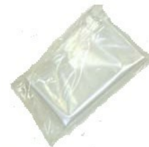
Clear Polyliner Recovery Bags - Included